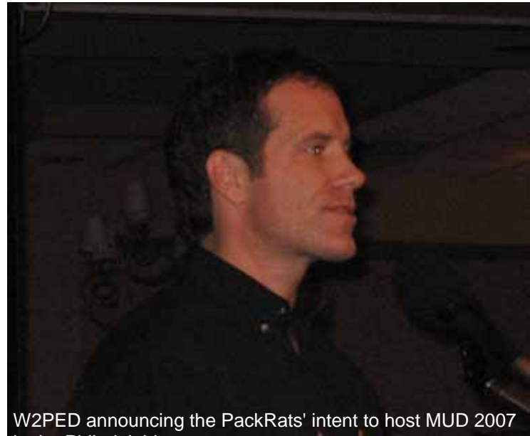
in the Philadelphia area.